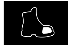
NON METALLIC TOECAP