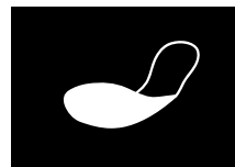
FLEXIBLE ANTI-PUNCTURE INSOLE