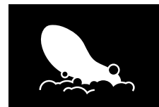
WASHABLE REMOVABLE INSOLES