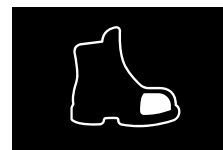
NON METALLIC TOECAP