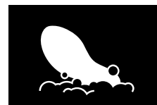
WASHABLE REMOVABLE INSOLES