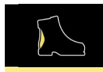
3M ® REFLECTIVE STRIPS